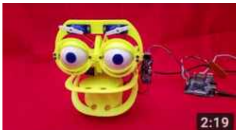
3D printable puppet head 2:19 music 3D printable STL files on Thingiverse.com: https://www.thingiverse.com/thing:2863069