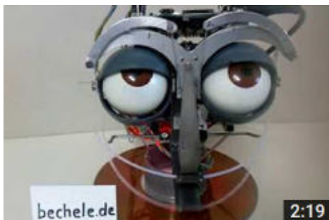
Robot Face with 8 Servos 2min 19 sek. Music